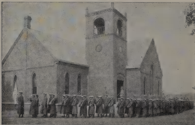
COLLINS BOYS' SCHOOL, CHEMULPO

Dusty and weary with their long journey, they took time to tell a little of the wonderful work done in the North